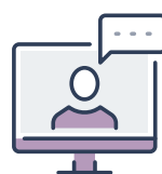
Real-time events with industry pros

Surge Micro-credentials are short, focused learnings that accelerate your skills in a specific area. For each credential, you earn industry-recognized micro-credential and/or micro-learning digital badges.